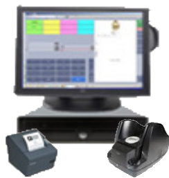
Quick Modules Cashier Workstation